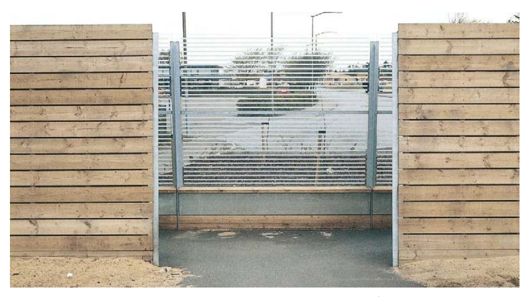
Figure 2.7. 2.5 m high wooden noise barrier in Denmark with passage for pedestrians and bikes at National Road 411 in Skive. A transparent barrier is used behind the wooden barrier to create a noise sluice [1].

The further the receiver is from a noise source, the greater the reduction. This reduction is also dependent on the character of the terrain lying between the source (the road) and the receiver. This form of noise reduction is called terrain reduction, and is an independent factor that is not immediately related to noise screening [6, 7].