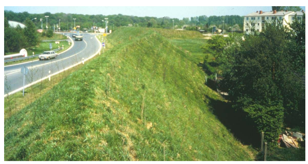
Figure 3.20. Earth embankment as a noise barrier in Germany.

If the desired barrier height is more than 4 to 5m (13-16 ft), it will often be easier to harmonize an earth embankment with the surrounding landscape than a noise barrier. As they require a relatively large amount of space, earth embankments will primarily be used in the countryside and in connection with areas where housing is less dense or scattered. In the course of a few years, a manmade earth embankment with vegetation will appear to blend in with nature. Earth embankments can have the effect of additions to the road environment and can enhance the natural character of the landscape.