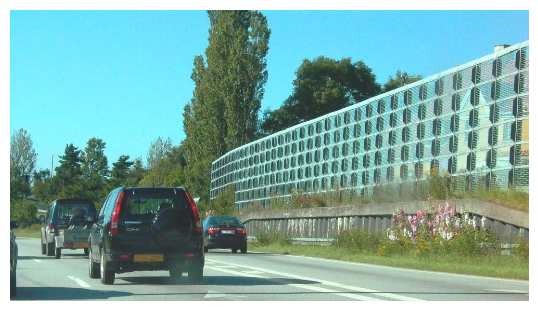
Figure 1.1. Noise barriers have a "front" side facing the highway. Transparent 5 m high noise barrier at a 1½ m high embankment at Highway M14 north of Copenhagen, Denmark.

Along existing roads and highways as well as in places where it will not be possible to reduce nuisance from noise through planning measures within the foreseeable future, it may be necessary instead to establish noise screening in the form of noise barriers or embankments. Where homes affected by noise in urban areas are situated close to the road from which the nuisance derives, it will not always be possible to find space for noise screening. In this case, the noise can be reduced through the insulation of the façades of the buildings, for example, by providing special noise reducing windows etc. An additional advantage of noise screening compared to the insulation of façades is that the former also provides a reduction of noise at the outside areas adjacent to the road.