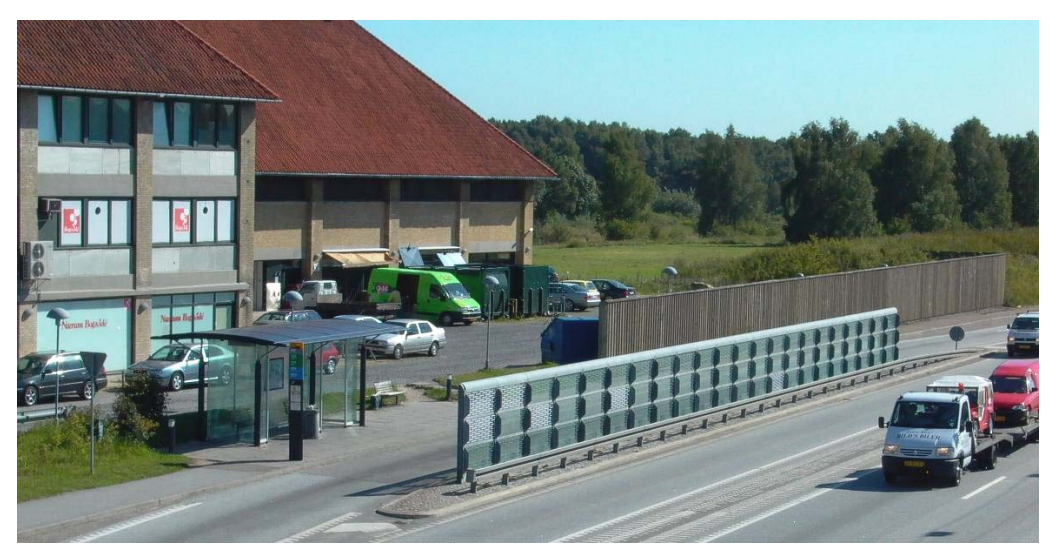
Figure 3.28. Transparent noise barrier in Nærum at bus stop along Highway M14 north of Copenhagen, Denmark.

Acoustically, a tunnel is the most effective way of lowering traffic noise. The covered area can be used as a sports ground or a park. As a noise-reducing installation, a tunnel has many advantages with regard to design, but construction costs are high.