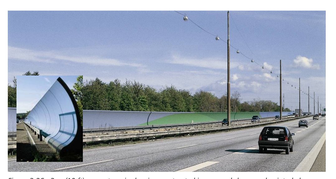
Figure 3.26. 3 m (10 ft) concrete noise barrier constructed in a curved shape and painted along Highway M13 in Gladsaxe north of Copenhagen, Denmark [1].

Concrete can be used to give noise barriers many different shapes. Concrete barriers can be given many different surface structures and they can be constructed with plant boxes, so that they can be combined with vegetation. Concrete can also be colored and thus adapted to the surroundings; for example, a barrier can be colored dark brown, which forms a good background for vegetation. If concrete is treated properly, good results can be achieved, and with its thickness and structure, concrete has qualities that can fit in a well with the road environment.