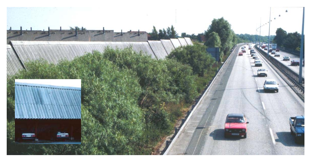
Figure 3.15. The roof of the carport construction for a residential row house area used as a high noise barrier along the M3 ring road around Copenhagen, Denmark [3].