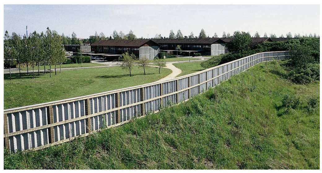
Figure 3.34. 1½ m high eternite (fiber cement) noise barrier with wooden frames on top of an earth embankment at Highway M10 in Greve vest of Copenhagen, Denmark. The barrier has steel net where plants can grow as times goes by [1].

It is necessary to give vegetation good growth conditions including access to sufficient water. At dry locations irrigating systems might be needed. Vegetation must have plenty of soil to grow in and while being protected from salt water from the winter maintenance of the road.