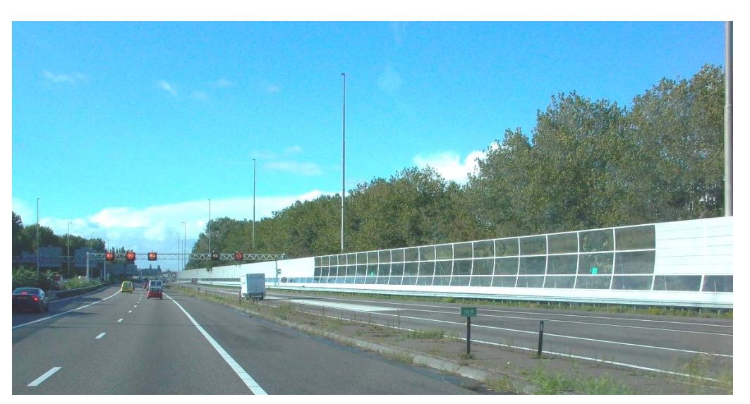
Figure 3.29. Dutch curved steel noise barrier with long transparent section.