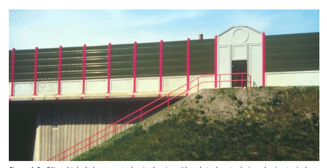
Figure 1.6. 3½ m high dark green steel noise barrier with red steel posts designed using typical building shapes of the surrounding urban environment along a highway south of Hanover, Germany [3].