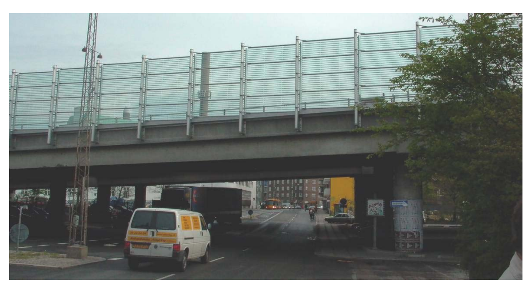
Figure 3.1. Transparent noise barrier designed for use on a highway bridge in an urban environment in Nørrebro, Copenhagen, Denmark.