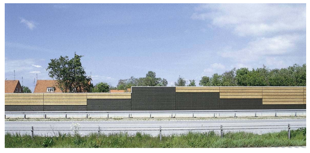
Figure 3.3. 2 to 3 m (6 to 10 ft) high wooden noise barrier at Highway M30 in Sakskøbing in Denmark [1].

Noise screening constructions are seen by different groups of road users and residents who pass the installation at very different speeds. Residents living near a noise screening installation have a direct and constant view of it from their windows, from outdoor activity areas and approach roads. Pedestrians and cyclists pass the installation at low speeds and therefore have times to perceive details of form and colors.