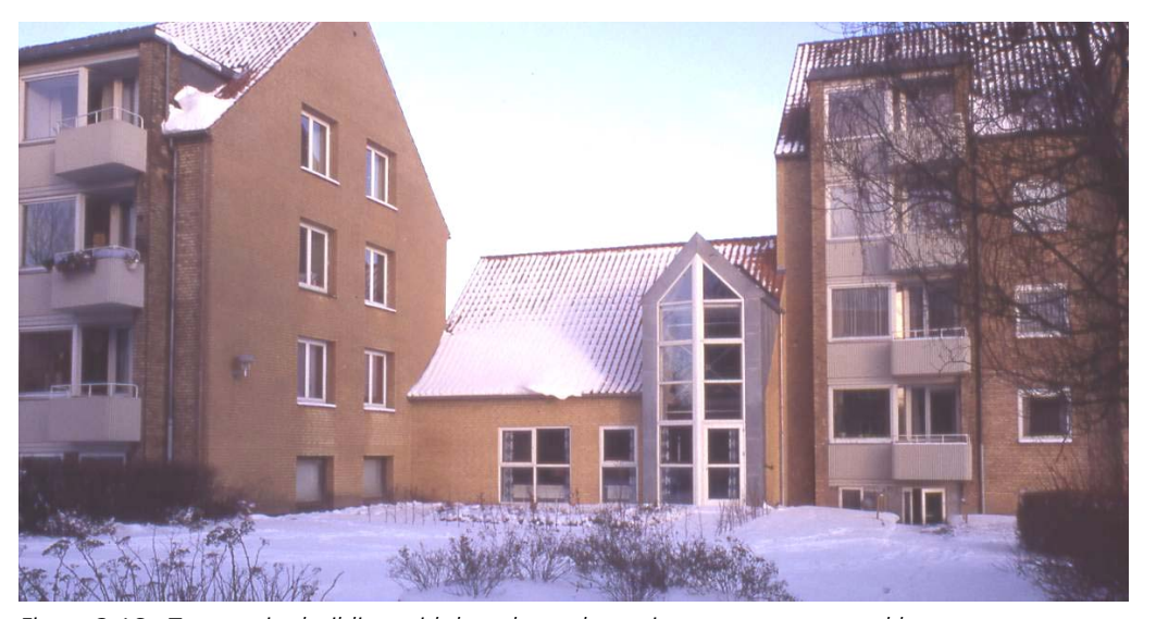
Figure 3.16. Two stories building with laundry and meeting room constructed between two apartment blocks also to function as a noise barrier for the road noise in the hole between the apartment blocks reducing the noise at the outdoor areas in Århus, Denmark.