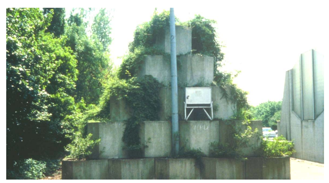
Figure 3.22. Supported earth embankment made of concrete pipes piled on top of each other in triangles and filled with earth along Highway A3 near Cologne in Germany [3].