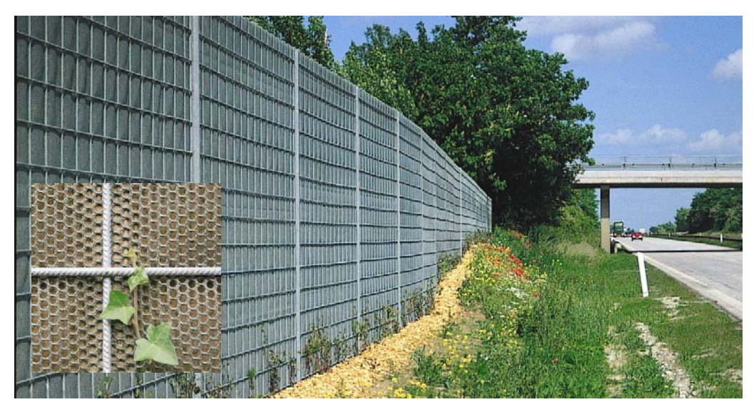
Figure 2.12. Danish absorbing noise barrier made as a steel frame with absorbing mineral wool and a steel grid in front (close op in left corner).