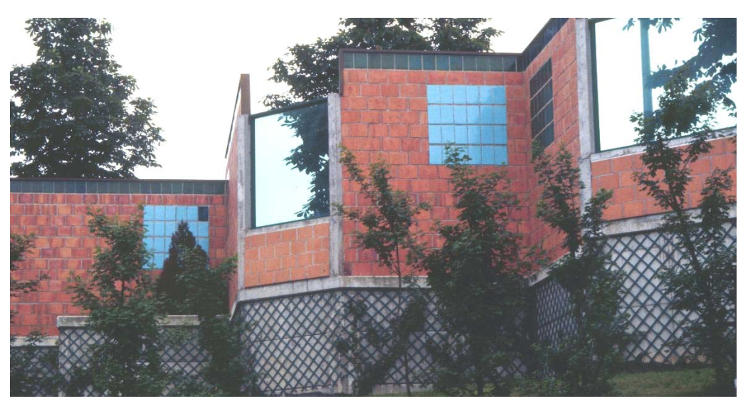
Figure 3.2. Noise barrier constructed of bricks with a lot of details along a highway at an urban residential location in Paris [3].

In both cases, the barrier will have two façades, one towards the road, the other towards neighboring buildings or the adjacent landscape. In an urban environment, the acoustic demands for noise reduction might not be the sole criteria for the height and form of the barrier, as visual criteria may also be of decisive importance for the final decision regarding its height.