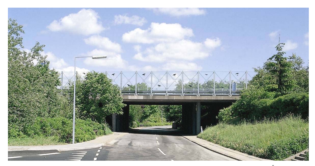
Figure 3.8. Transparent noise barrier used where Highway M70 crosses a local road in Ålborg, Denmark [1]. This allows the drivers on the highway to get a sight of the surrounding landscape.

The height of a noise screening installation is also important for road users and their possibilities of orientation in the urban area or landscape through which they are passing. Even the erection of a 1.5 m (5 ft) high barrier affects visibility conditions for motorists. They will, however, still have a certain overview of the town or landscape. With a barrier that is 3 m (10 ft) high, it is only possible to see the highest elements in the surroundings, such as multi-storey buildings, water towers, church towers or hilltops, which typically function as landmarks. A barrier of 5 m (16 ft) will, however, cut off practically all view of the surroundings. In such cases, high consideration must be taken of the form, colors and materials of the noise screening in order to ensure that motorists have an acceptable road space to look at.