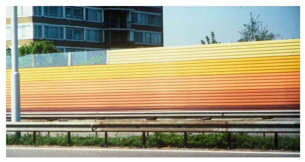
Figure 2.17. 4½ m high colored noise absorbing steel barrier with perforated surface and absorbing material at Highway A9 in the Netherlands [3].