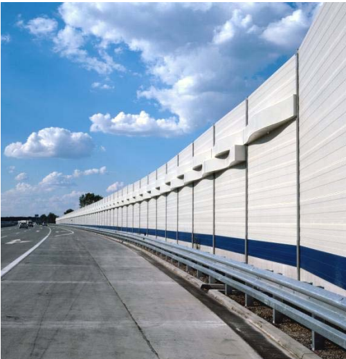
Figure 3.31. Steel and transparent noise barrier along highway in Vienna, Austria.

It is important that noise barriers are kept clean and in a good state of repair, as neglected or soiled barriers are very liable to give the road and its surroundings a shabby and decaying appearance. Graffiti can be a problem in relation to noise barriers. Effective methods for removal are available. Vegetation and difficult access to barriers reduces the risk for graffiti. Transparent barriers can at some locations increase the risk of vandalism. Artificial transparent materials (eg. acrylic or polycarbonate) are normally more resistant to vandalism than glass barriers. In planning a new noise screening installation, ongoing maintenance and cleaning of the structure should be considered.