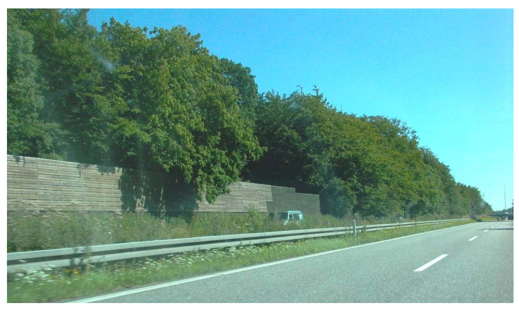
Figure 1.4. Brown wooden noise barrier adapted to the green surroundings on Highway M11 west of Roskilde, Denmark.

In connection with the planning and the design of noise screening structures, it is important that it should be adapted to the road and its surroundings. An increasing proportion of people's time is spent commuting on highways, and it is therefore an important task to make this time a positive experience, among other things, by seeking to ensure that roads pass through attractive surroundings.