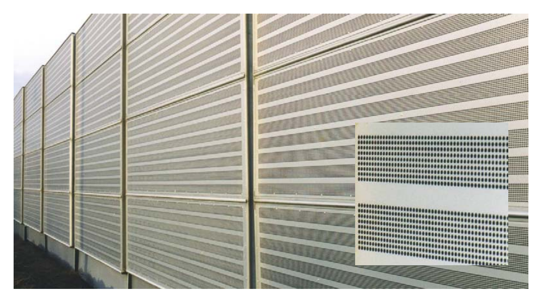
Figure 2.14. Noise absorbing steel barrier with perforated surface and absorbing material at a highway in Denmark (close up to the right) [2].

Finally, there is a third solution, in which a noise barrier is provided with sound absorbent material on the side facing the road, so that reflection is reduced or entirely eliminated (see Figure 2.12 to 2.15).