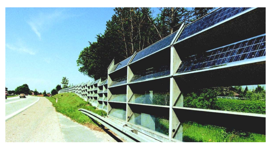
Figure 3.14. Transparent steel noise barrier with electric solar panels at the top. At Highway M11 at Fløng, West of Copenhagen, Denmark [1].