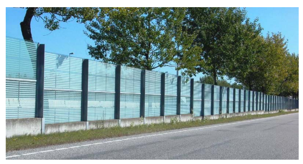
Figure 2.8. 2½ m high transparent noise barrier reflecting noise to the other side of the road along Highway M14 north in Gentofte of Copenhagen, Denmark [1].