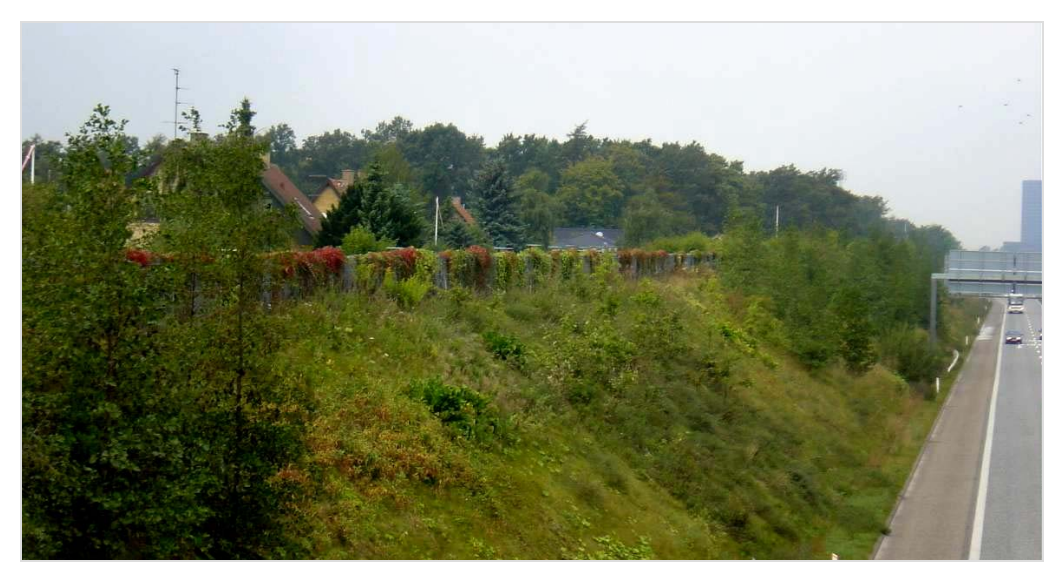
Figure 3.24. Noise barrier with vegetation on top of earth embankment in Denmark [2].