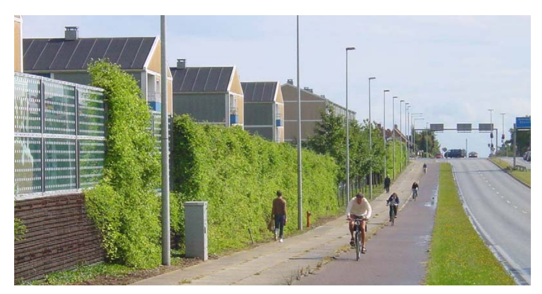
Figure 2.11. Danish transparent noise barrier with vegetation that can reduce the noise reflection.