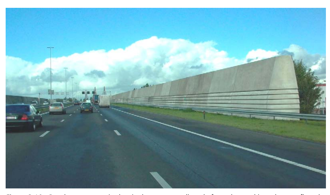
Figure 2.10. Dutch concrete noise barrier bent at a small angle from the road in order to reflect the noise upwards to reduce the disturbance of residents on the other side of the highway.

There are different solutions to reflection problems deriving from noise screening installations. These solutions involve different visual impacts, which can make their mark on the surroundings of the road. The barrier can be erected at a slant so that the noise is reflected up into the air, where it will not disturb anyone (see Figure 2.9 and 2.10). For an earth embankment with sloping sides this will always be the case.