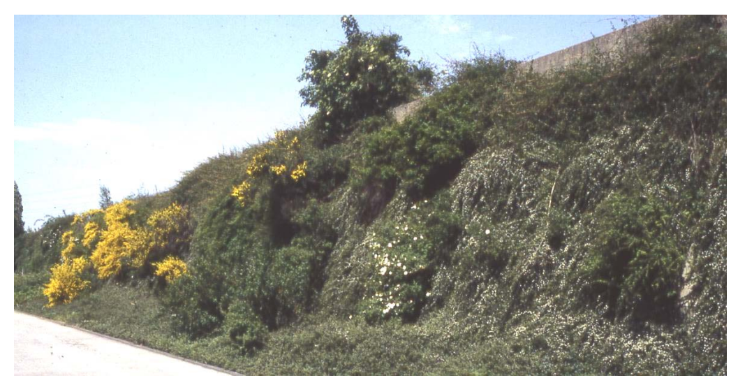
Figure 3.23. 7 m (23 ft.) high supported earth embankment with vegetation along Highway A3 near Cologne, Germany [3].