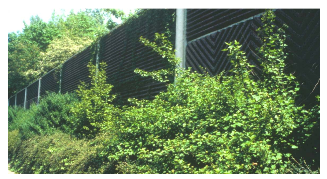
Figure 1.5. 4 m high profile brown concrete noise barriers with 1 m high plant box for vegetation along Highway A4 southeast of Cologne, Germany [3].