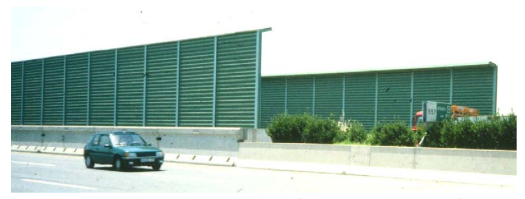
Figure 2.5. High noise barriers placed both at the side of a highway and at the center of the highway in order to increase the noise reducing effect at a highway in Italy.

In areas close to the end of the noise barrier its effect diminishes because the sound propagates around the end of the barrier. Therefore, the barrier should be continued some way past the noise-sensitive area or be concluded by a curve along the border or the area, away from the road.