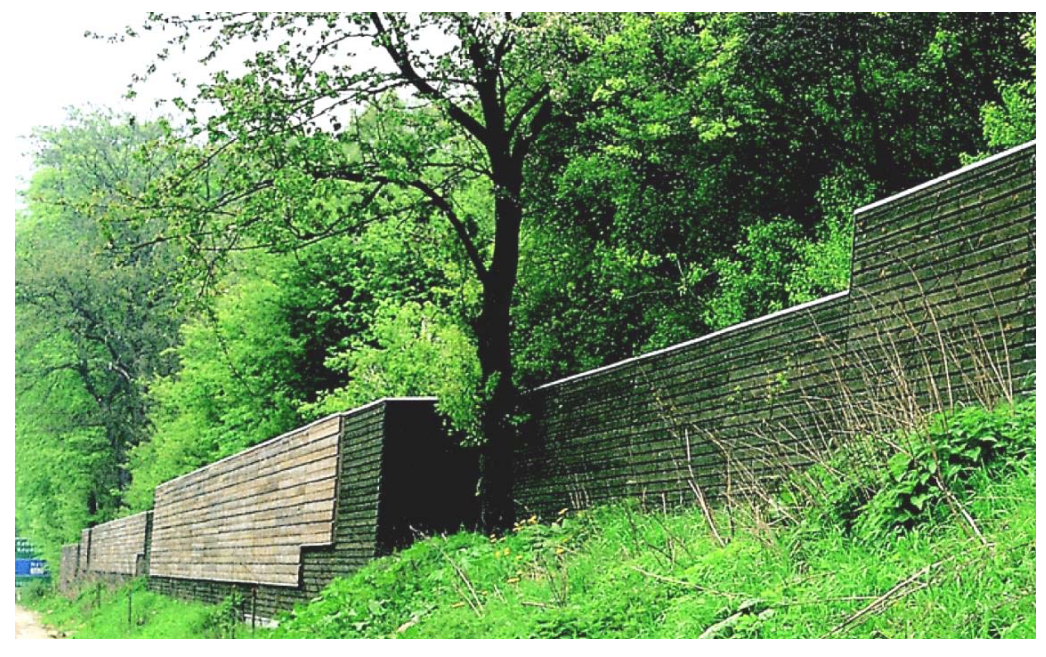
Figure 3.7. 3 m (10 ft) high wood noise barrier along a highway at the countryside adapted to the existing old vegetation at Highway M40 near Nyborg, Denmark [1].

In cases where a noise barrier is to be placed at the countryside, where the buildings are not situated close to the road, the barrier could be adapted to the road, the land-scape and to the existing vegetation.