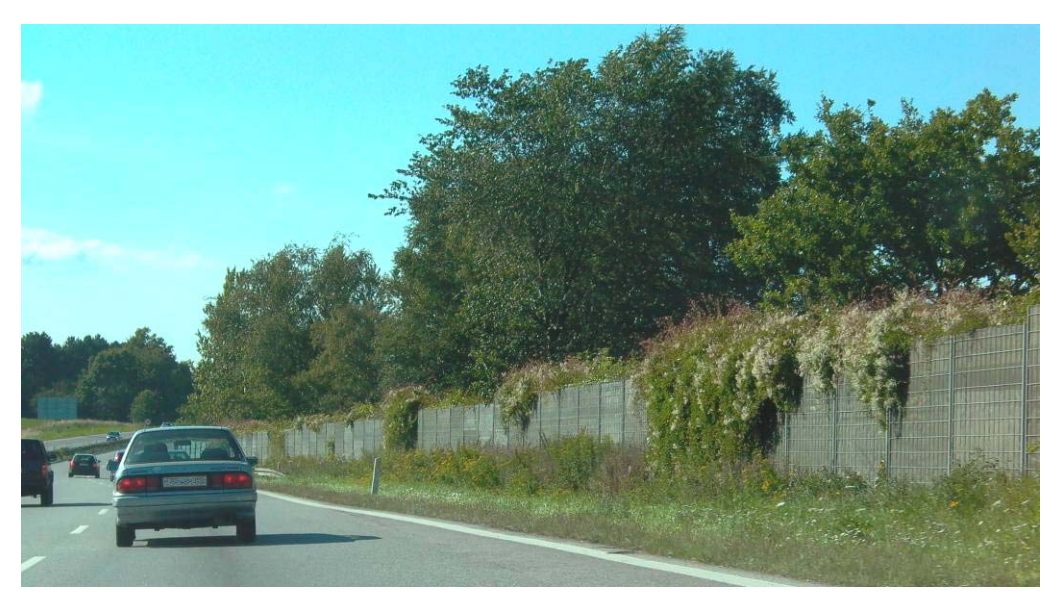
Figure 2.13. Absorbing noise barrier with vegetation at Highway M14 north of Copenhagen, Denmark.

Finally, there is a third solution, in which a noise barrier is provided with sound absorbent material on the side facing the road, so that reflection is reduced or entirely eliminated (see Figure 2.12 to 2.15).