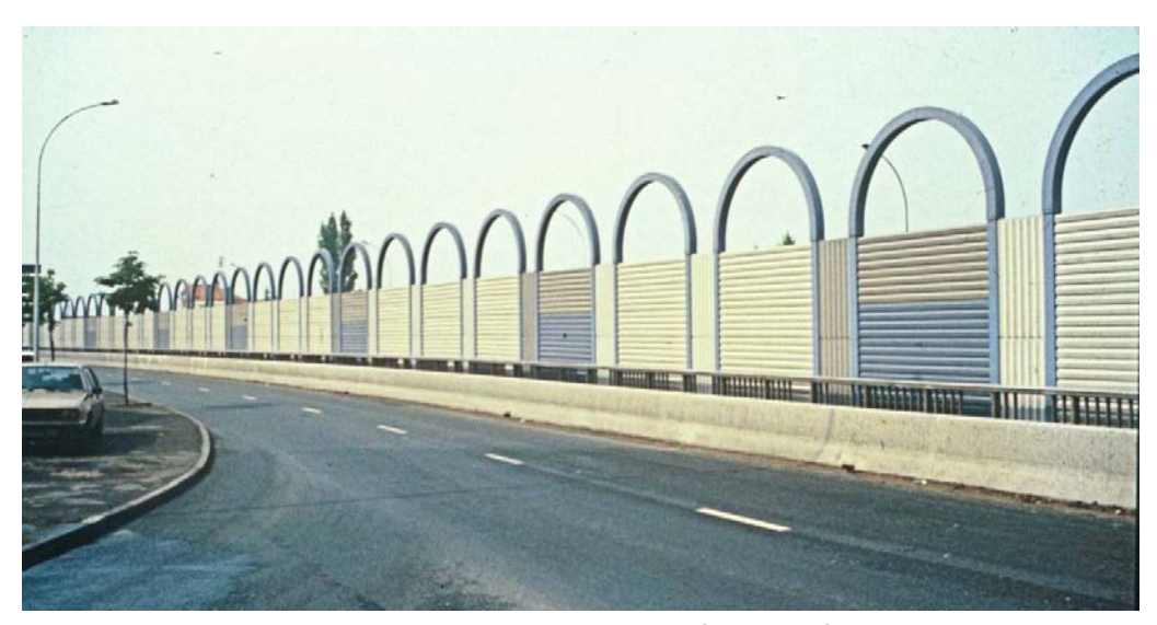
Figure 2.18. 4 m high noise absorbing steel barrier with perforated surface and absorbing material at Highway A6B in Paris, France [3].