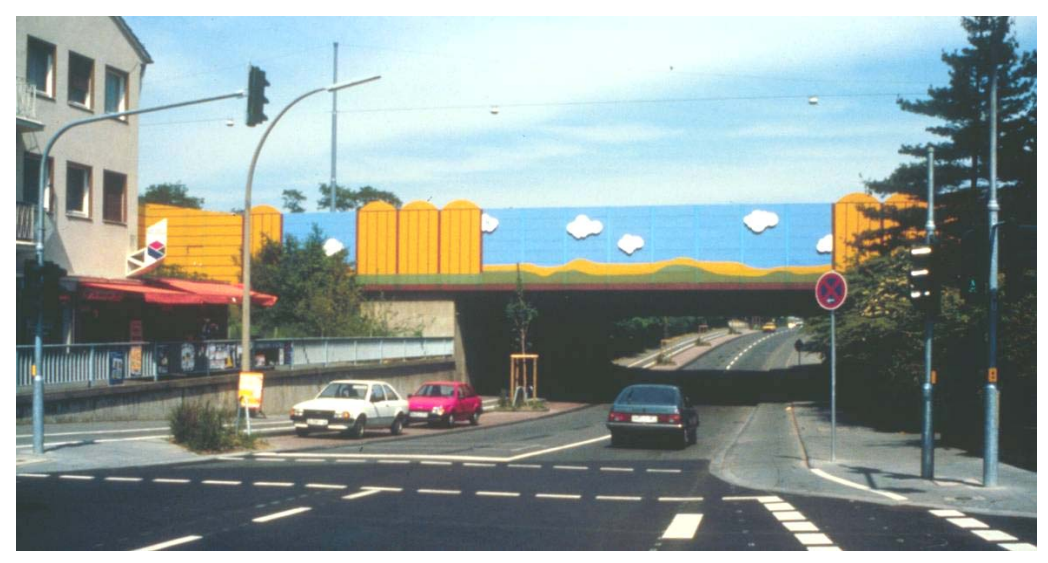
Figure 3.17. Noise barrier as a colorful urban element where Highway 555 in Germany passes on a bridge over a local road [3].