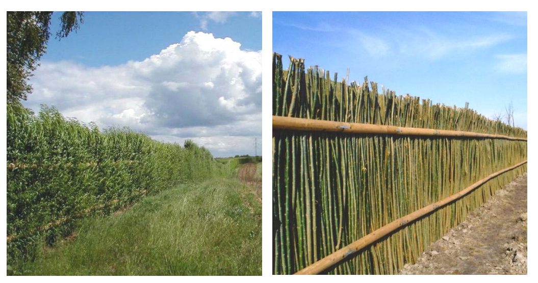
Figure 3.36. Green noise barrier made of panels with willow branches at both sides. When newly constructed to the right and after getting green to the left [2].