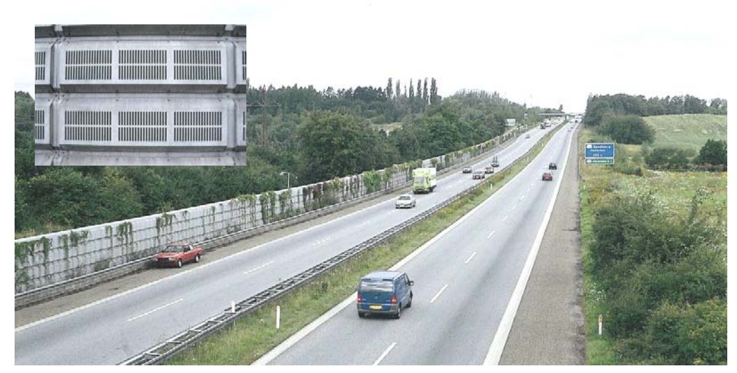
Figure 2.15. 3 to 3½ m high steel noise barrier with absorption elements (see close up to the left) and support for vegetation on Highway M14 north of Copenhagen, Denmark [1].