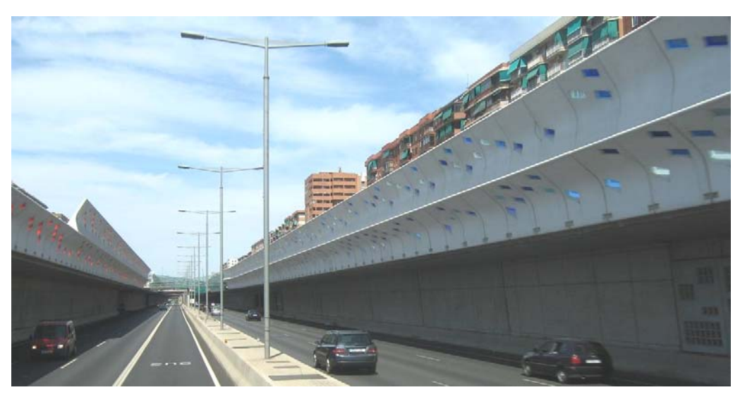
Figure 2.4. Depressed highway partly covered at the road sides and with white concrete noise barriers bending over the highway with colored transparent elements in Barcelona, Spain.

Noise screening normally has a noise reducing effect up to the second or maybe the third level of a building depending on the barrier height and how close to the road it is placed. The effect diminishes if the buildings are higher than that. For buildings of more than two stories, it may thus be necessary to install special noise-insulating windows in order to obtain reasonable noise levels indoors, unless, of course, very high noise barriers have been used. Even in the case of a multi-floored building, noise barriers can be used to reduce noise at outdoor areas (gardens, balconies at ground level etc) and for the lowest floors of the building.