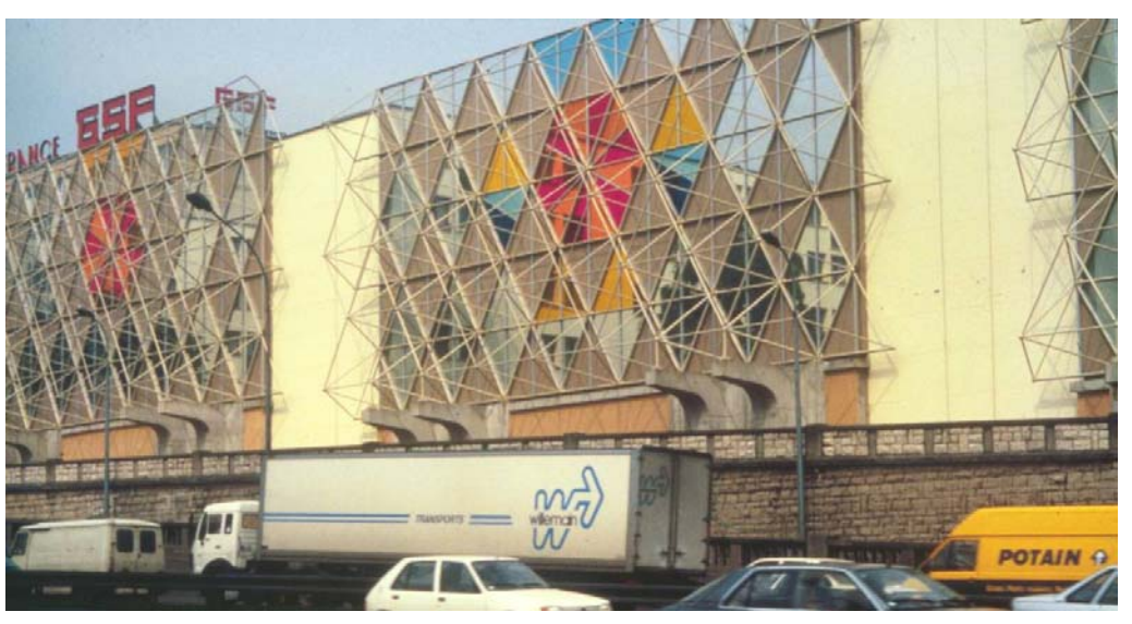
Figure 2.2. 20 m high transparent and colored noise barrier in Paris, France between two 5 story apartment blocks [3].

Acoustically, a tunnel is the most effective way of lowering traffic noise (see Figure 2.1). The covered area can be used as a sports ground or a park. As a noise-reducing installation, a tunnel has many advantages with regard to design, but construction costs are high.