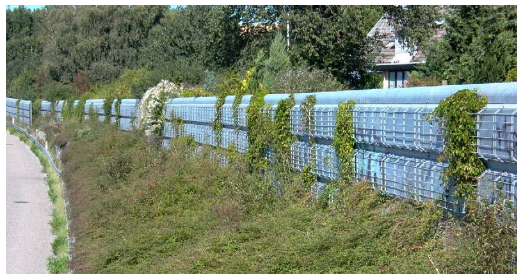
Figure 3.32. Steel noise barrier with steel grid to support vegetation on the barrier at Highway M14 north of Copenhagen, Denmark.