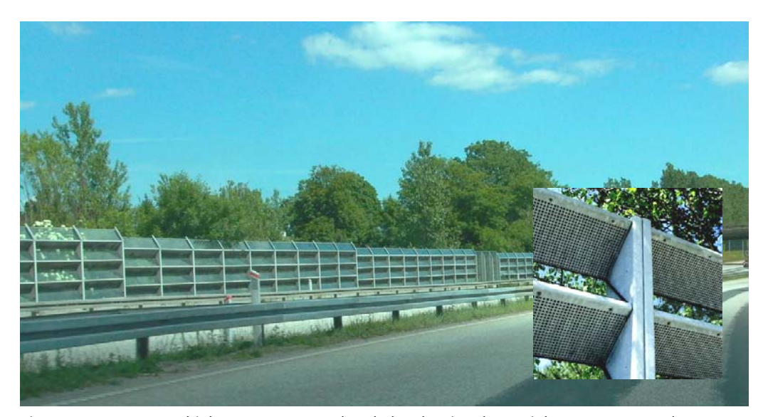
Figure 2.16. 3 to 4 m high transparent steel and glass barrier along Highway M11 near Fløng west of Copenhagen, Denmark [1]. The glass is placed at an angel of 45 ° to reflect the noise up in the air. The bottom sides of the steel elements are noise absorbing, see inserted photo to the right.