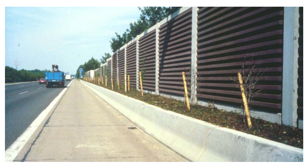
Figure 3.19. 4 m (13 ft) high brown profiled concrete noise barrier with 1 m high plant box with new vegetation in the front at Highway A4 in Germany [3].

Vegetation can also be used to break the monotony of long straight surfaces. If part of the barrier is formed as a plant box, this may make the barrier seem lower than it really is.