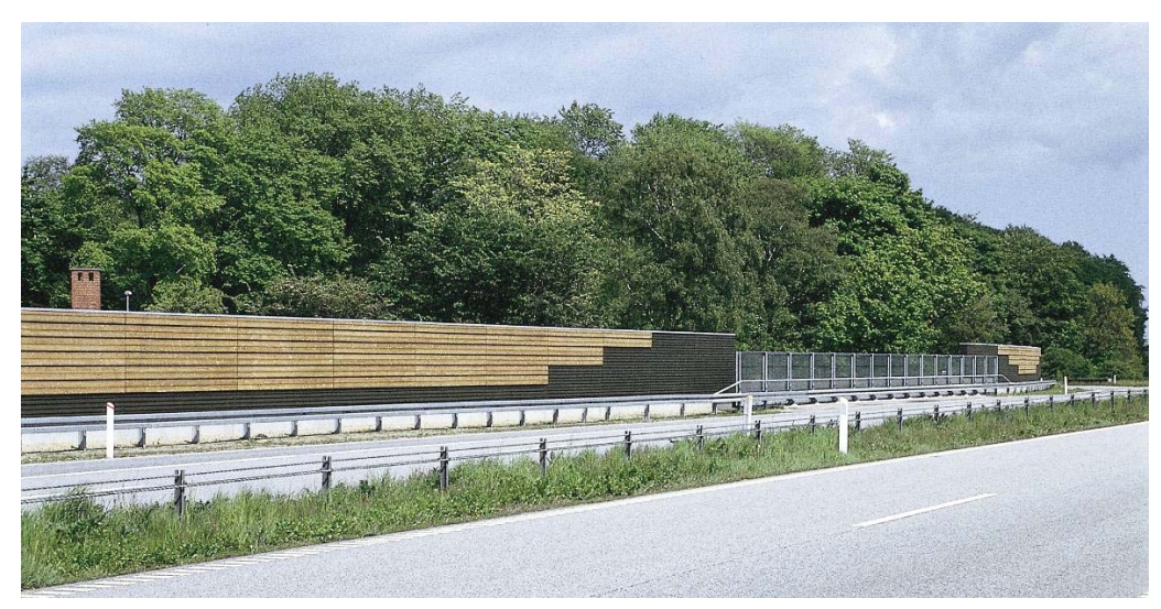
Figure 3.11. Transparent section as part of long wooden noise barrier where Highway M30 passes over a local road in Sakskøbing in Denmark [1].