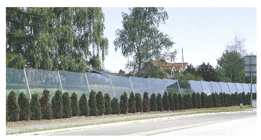
Figure 2.9. 2 m high Transparent noise barrier tilted away from the road in order to reflect the noise upwards to reduce the disturbance of residents on the other side of the road, at National Road 152 in Næstved, Denmark [1].

For low, open housing areas the noise level on the opposite side can theoretically be increased by up to 3 dB due to reflections form a barrier [5, 6]. This is a significant increase as it corresponds to the increased noise level resulting from a doubling of traffic.