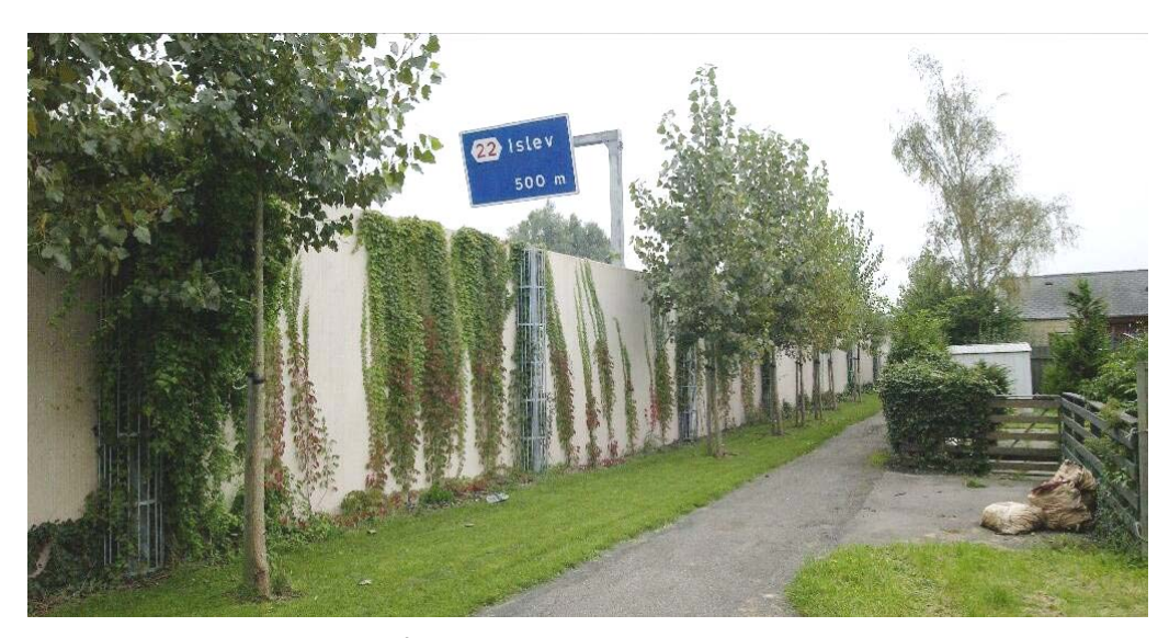
Figure 3.6. The residential side of a concrete noise barrier with vegetation along a high speed highway in Copenhagen, Denmark [2].

In cases where a noise barrier is to be placed at the countryside, where the buildings are not situated close to the road, the barrier could be adapted to the road, the land-scape and to the existing vegetation.