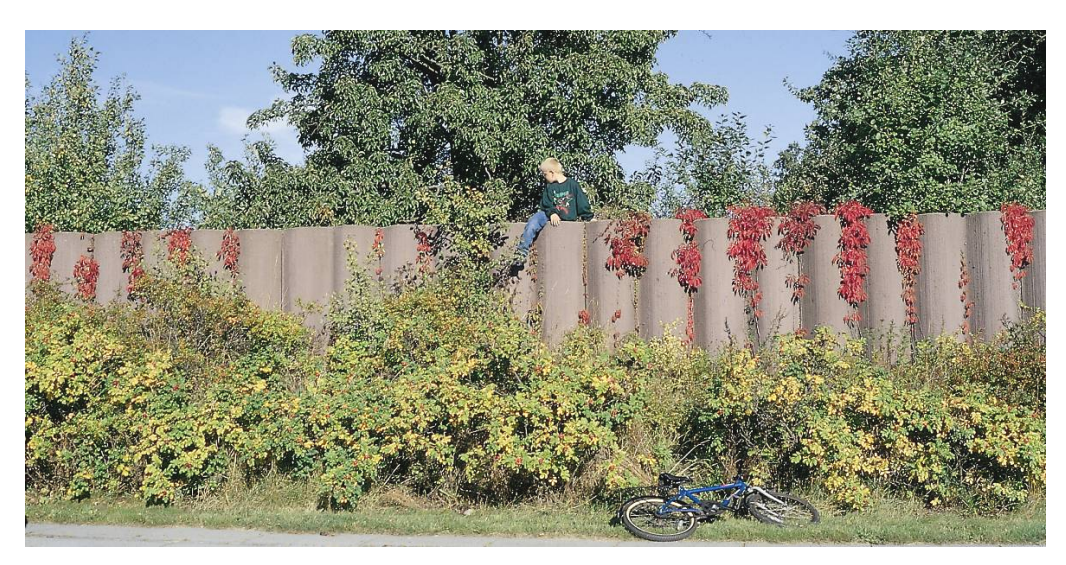
Figure 3.4. Brown concrete noise barrier with details and vegetation adapted to low a speed road in an urban environment in Århus along National Road 405 [1].

Noise screening installations should be constructed so that they make a good visual impression on the different groups of road users who pass by at different speeds. It may be desirable that the side facing a motorway, where road users drive at a speed of 100 km/h (60 mph), should be formed differently from the side facing some building and recreational areas.