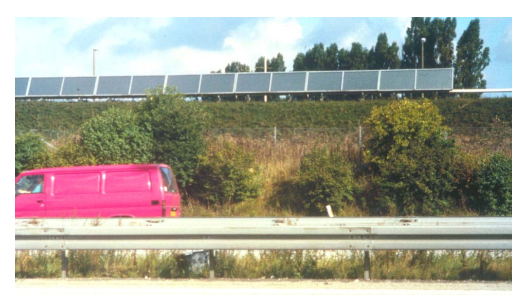
Figure 3.13. Earth embankment with solar panels on the top in Copenhagen, Denmark [3].