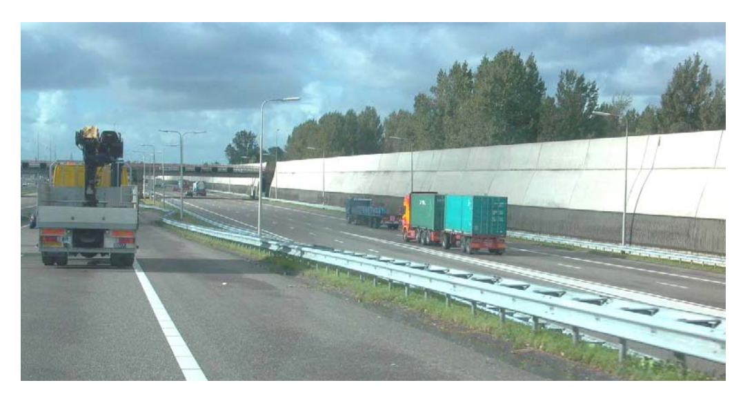
Figure 1.3. Noise barriers can be large structures which have an impact on the local physical environment. Shaped gray and white concrete barrier at a highway in the Netherlands.

Noise barriers and noise embankments are often relatively large and conspicuous structures which may not fit in with the surrounding environment. When a noise barrier has been erected, it represents a considerable economic investment and can be expected to remain standing for several decades. The people who live in the neighborhood of a noise barrier will have to look at the structure every day. This is also true for pedestrians, cyclists or motorists who daily pass a noise barrier. A noise barrier or noise embankment could therefore be regarded as a structure that has two facades, one facing the road and one the nearby town or landscape.