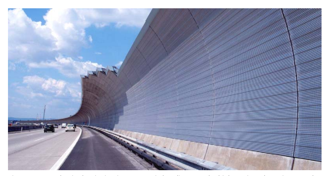
Figure 2.3. Steel noise barrier in Vienna, Austria bending over the highway in order to increase the noise reduction.

The effective barrier height marks the distance between the top of the barrier and a straight line drawn between the receiver and the source of noise. The larger the effective barrier height, the greater the noise-reducing effect.