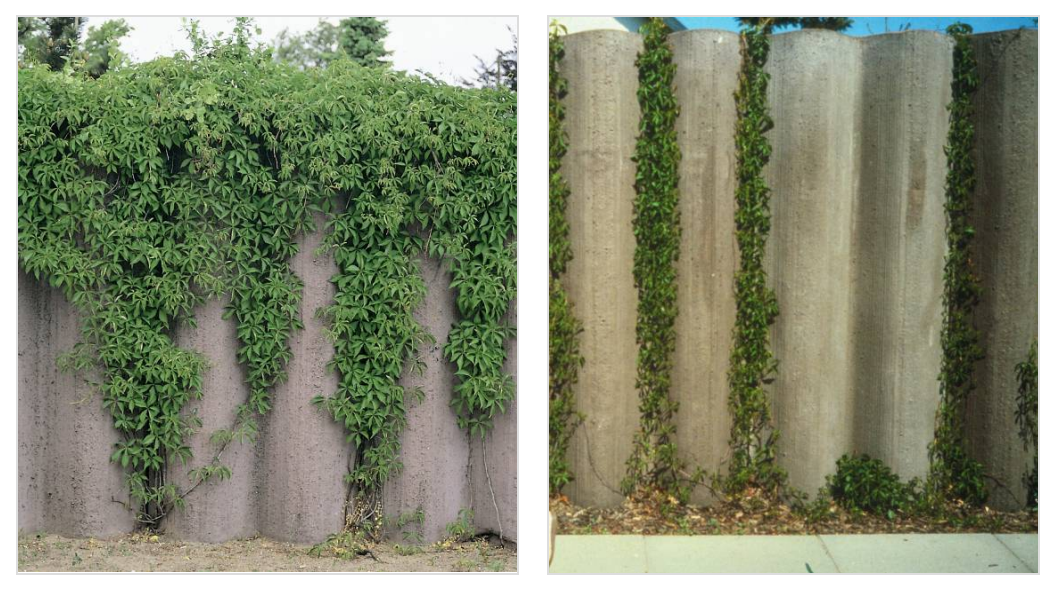
Figure 3.25. Colored concrete noise barrier made of 8 cm (3 in.) thick corrugated element with green vegetation at National Road 405 in Århus, Denmark [1, 3].

If vegetation is planted along a wooden barrier, this can, however cause maintenance problems, as the plants will have to be removed when the barrier is to be painted.