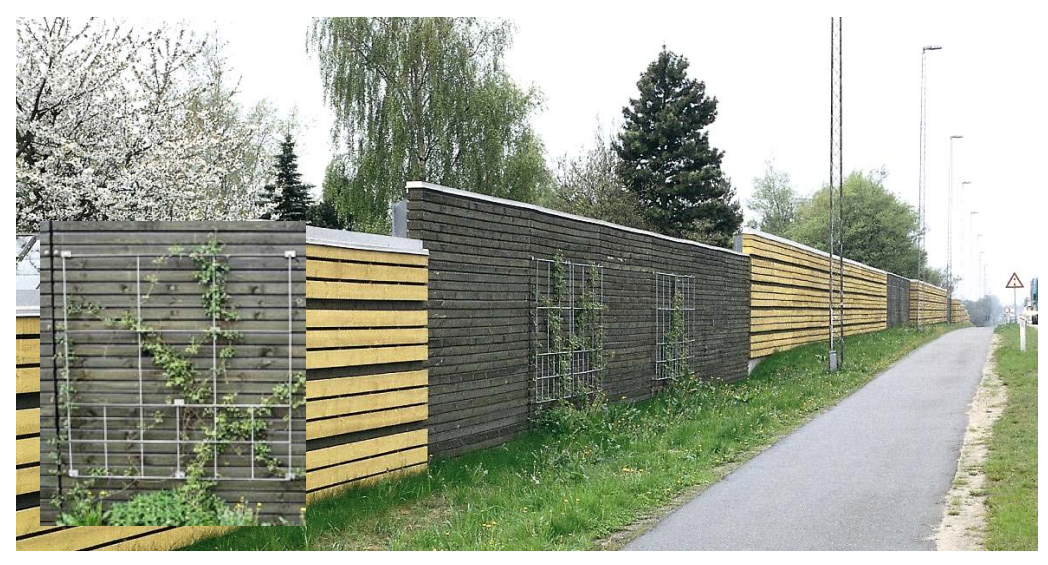
Figure 3.35. Wooden noise barrier with steel net to support vegetation at National Road 310 in Horsens, Denmark (detail to the left).