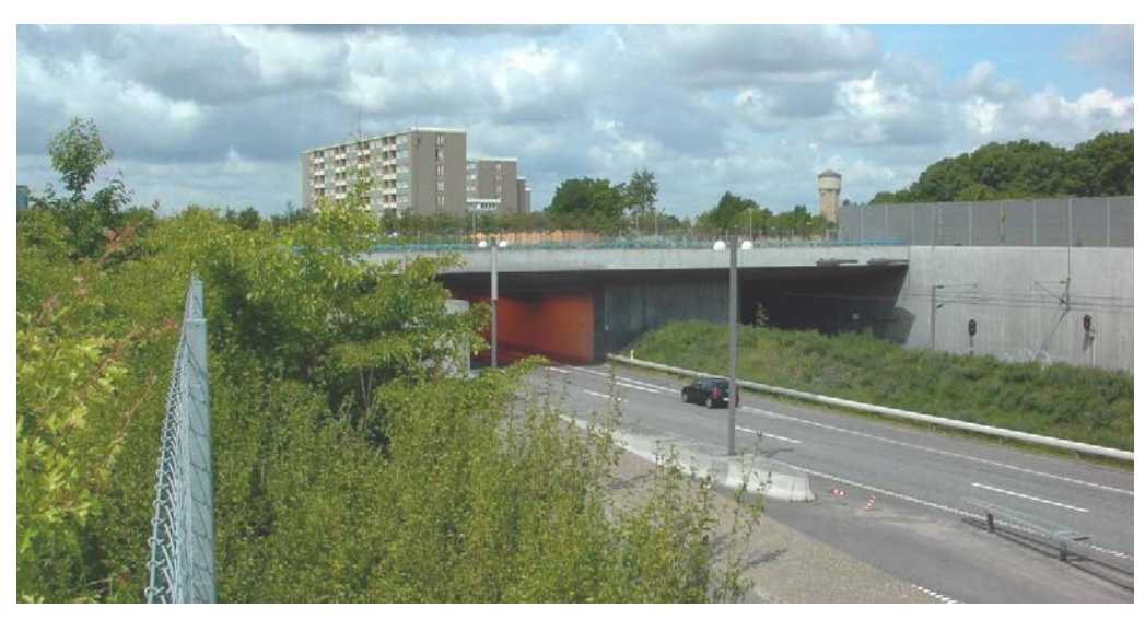
Figure 2.1. 700m long concrete cover over a new highway alignment to Copenhagen Airport through a preexisting residential area with apartments. The cut-and-cover strategy used here solved two problems; reducing traffic noise levels and keeping the new roadway from dividing the community. The covering has been planted and established as a green recreational area.