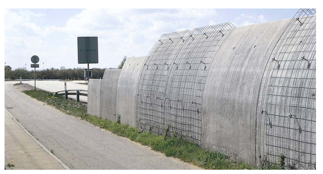
Figure 3.12. Reduced height at the end of a concrete barrier on National Road 411 in Viborg, Denmark [1].

Noise screening installations can be combined with other functions than noise protection, such as solar heating or electricity installations, garages, playgrounds, works of art or sculpture. Similarly, a noise barrier can function as fencing or boundary for a residential area.