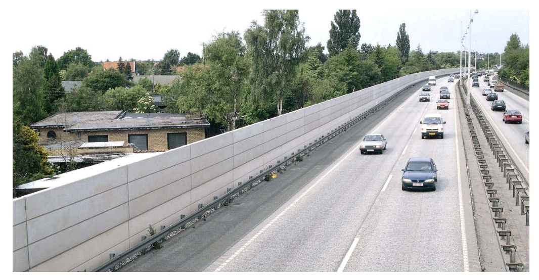
Figure 3.5. Highway side of 3\frac{1}{2} m (12 ft) concrete noise barrier in Rødovre along the M3 ring road around Copenhagen, Denmark [1].

Noise screening installations should be constructed so that they make a good visual impression on the different groups of road users who pass by at different speeds. It may be desirable that the side facing a motorway, where road users drive at a speed of 100 km/h (60 mph), should be formed differently from the side facing some building and recreational areas.