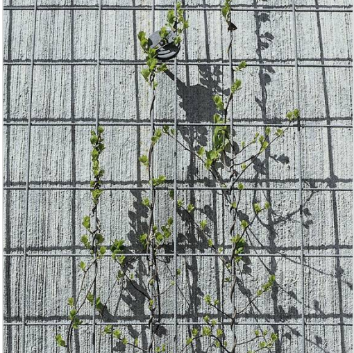
Figure 3.33. Steel nets to support green vegetation on the residential side of concrete noise barriers [1].

Roadside trees give the scenery of the road living variety, both through seasonal variations and through variations among individual trees. Provided that they are high enough, roadside trees planted in connection with noise screening can reduce the dominance of the barrier and give variation and an important aesthetic quality to the road and its surroundings. Planting of the median will divide up the road and contribute to drivers not being blinded by the headlights of oncoming traffic.