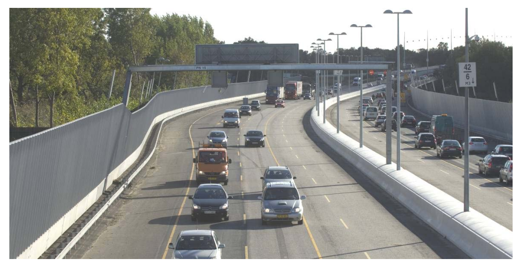
Figure 3.18. 4 m (13 ft) high aluminum absorbing noise barriers bent 10° towards the road along both sides of the M3 ring road around Copenhagen, Denmark.

Noise barriers and embankments should have a robust appearance and harmonize with the character of the road and its surroundings. However, they may also appear as deliberate contrasts to the surrounding in order to enhance weak but characteristic land-scape elements. Finally, the barrier can stand out as a unique landmark. Furthermore, it is important to use materials that wear well, so that the appearance of the barrier does not become more and more shabby. A smooth surface will be perceived as being larger than a broken surface. The use of different materials, colors and of vegetation can contribute significantly to breaking the monotony of long and high noise barriers.