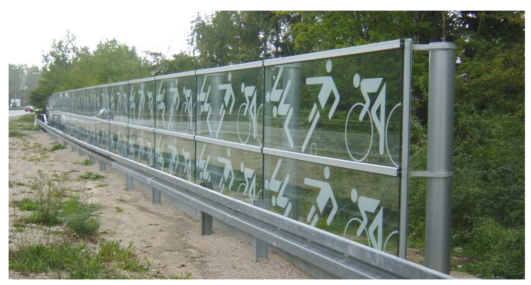
Figure 3.27. Transparent noise barrier with a "bike print" along a highway in am urban district in Denmark [2].