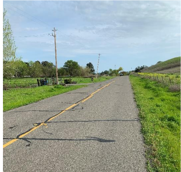
Figure 1. Transverse cracking (sealed) due to aging

Load-related cracking occurs only in the wheelpaths and is caused by asphalt bending under heavy vehicles, which fatigues the asphalt layers. This type of cracking (also called “alligator cracking”) has these characteristics: