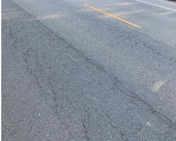
Figure 2. Load-related fatigue cracking in the wheelpaths due to heavy loading by buses

Among the non-cracking distresses, rutting most often occurs when rainwater passes through the cracked asphalt to the underlying base material or subgrade soil. Patches are the main short-term repairs used for fatigue cracking and potholes. Raveling, weathering, rutting, and depressions caused by heavy, slow-moving vehicles are most commonly associated with construction quality and/or asphalt mix design problems.